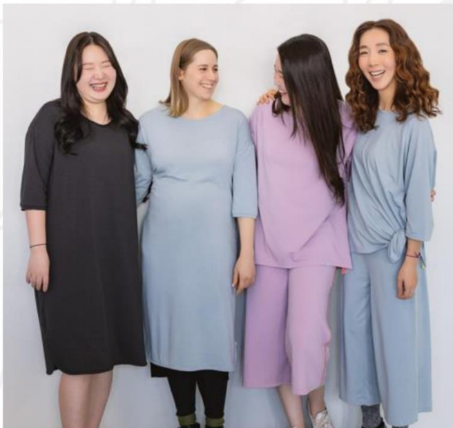
Loungewear with Health Benefits