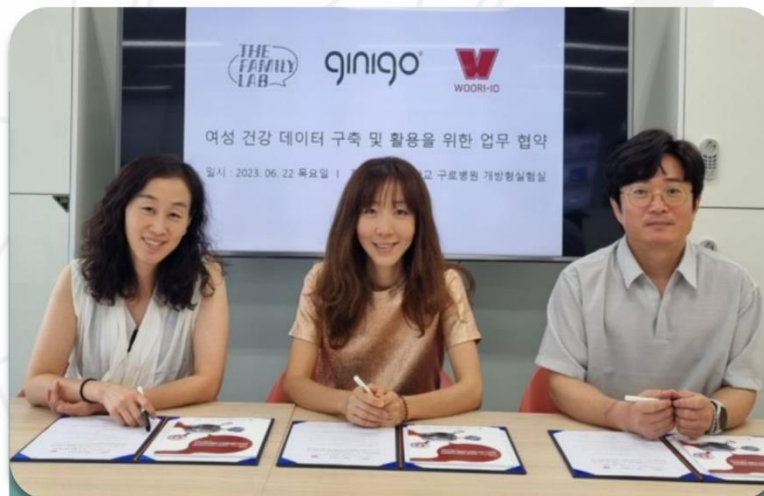
Collaboration between Selected Companies in the Korea University Guro Hospital Open Lab.