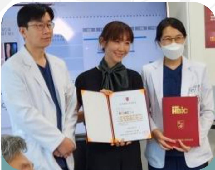
Postpartum Body Patch for Elasticity Improvement Cooperation with Korea University at Guro Hospital .